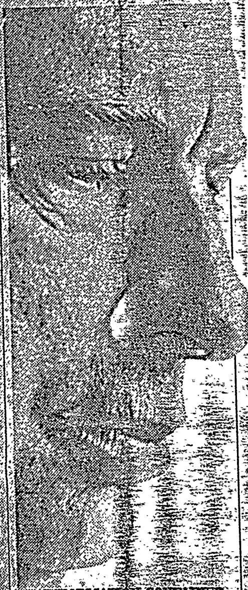
L. Ron Hubbard, 1911-86: the cult's founder and continuing inspiration

According to the Cult Awareness Network, whose 23 chapters monitor more than 200 "mind control" cults, no group