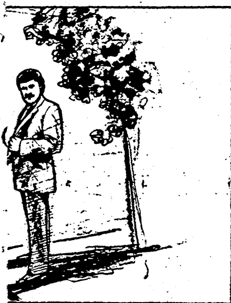
in Wharf. . . . gave me an envelope I he had just gotten the envelope and checks